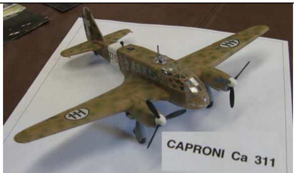
Caproni Ca 311 - Paul Leugers