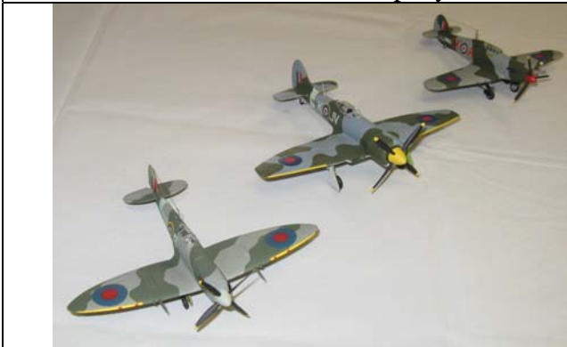
British 1/72 trio - Attilio Tore