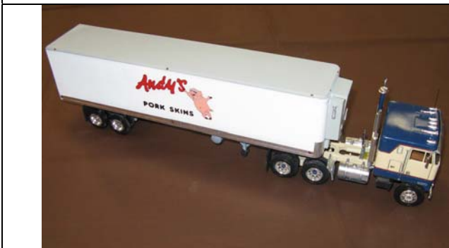
Kenworth Tractor Trailer - Randy Dosier