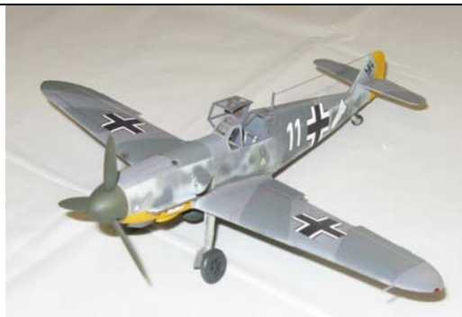
Me-109 1/48 ICM kit – Daryl Huhtala