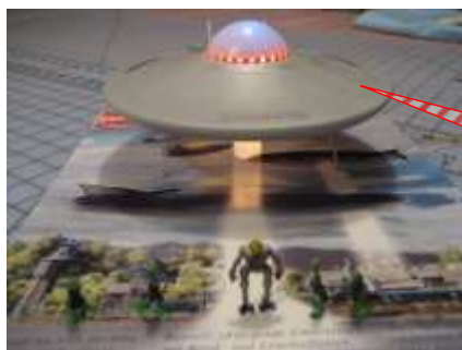
(UFO kit by Busch Gmbh)