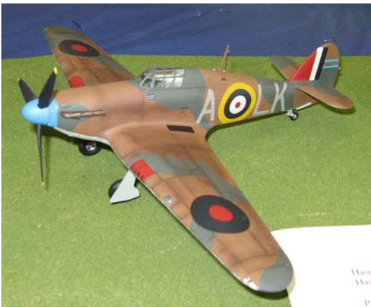
Model AOLX Pr