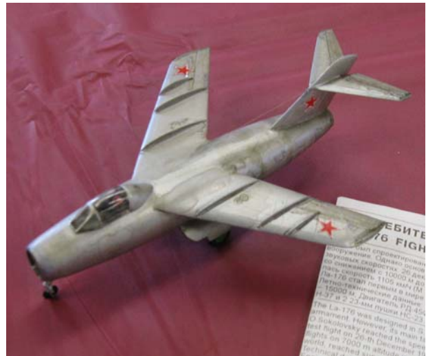
Isaac Zelasny – Yak25 and Il-176

The IPMS/USA 2011 Convention will be held in Omaha, Nebraska August 3-6. The 2012 convention will be at Walt Disney World, Orlando, Florida in August 2012. Special convention hotel room rates will apply there for a big savings.