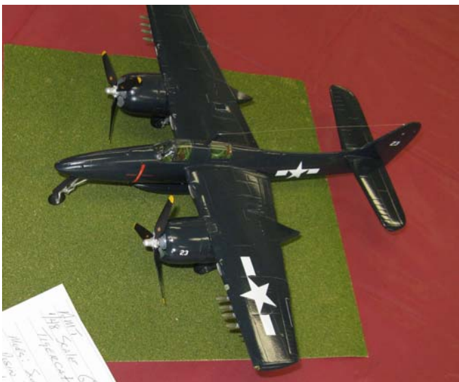
Tom Bebout – 1/48 Grumman Tigercat