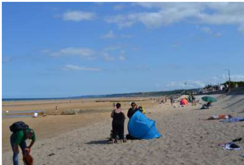
A Heller 1/72 LCVP “Higgins Boat” bought at the WWII Memorial Museum in Caen, France, which is not far from Omaha Beach. Price was €16.95 ($25). And also shown Omaha beach today.